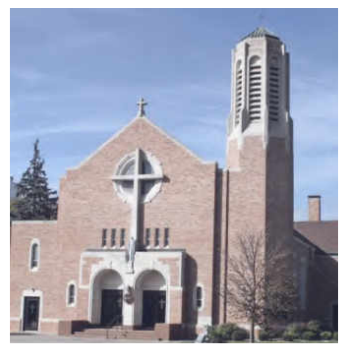
Sacred Heart Church 357 N Third Street, Baileyville, KS 66404 Website: www.shbaileyville.com